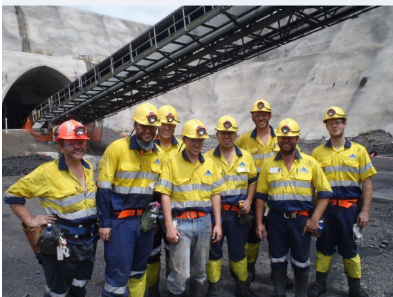
Photo: 'Cleanskins' who commenced work with Narrabri Coal 12 months ago.

The December 2012 intake included 13 people—10 operators and 3 fitters.